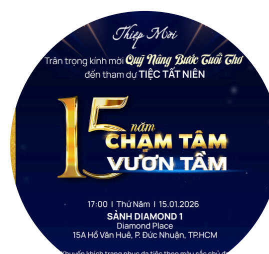
Attended Savouré Bakery's 15th Anniversary Event