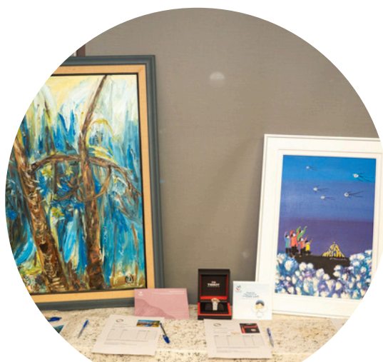
Evening of Appreciation Consular Club of HCMC