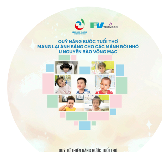
Meeting with retinoblastoma patients