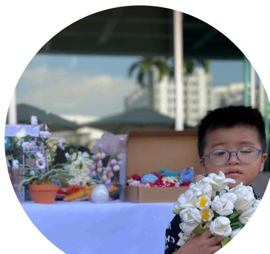
Christmas Market 2025