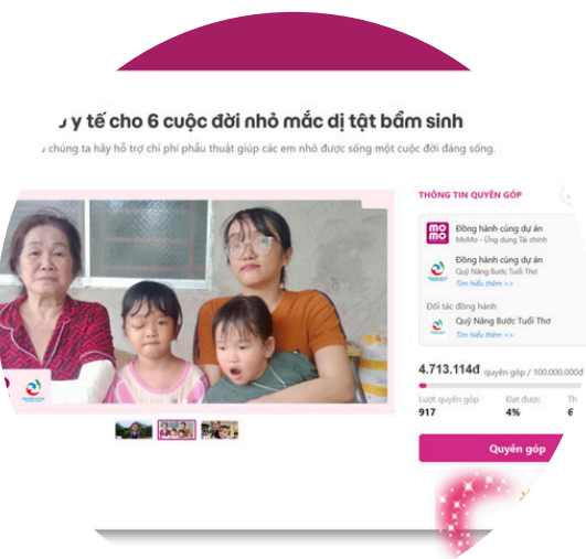
Medical Miracles for Six Young Lives on the MoMo Piggy Bank Community