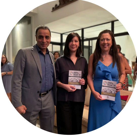
Consular Club Appreciation Reception 28th International Charity Bazaar