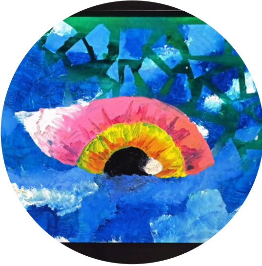
“Lighting Up Our World With Love” A Campaign for Children with ROP and Retinoblastoma

We would like to express our gratitude to all, for your kind heart and contribution. Your silent support has been and will be your long-lasting and reliable support for us. We all know, good deeds always bring good results and we will bring happiness to the children’s future.