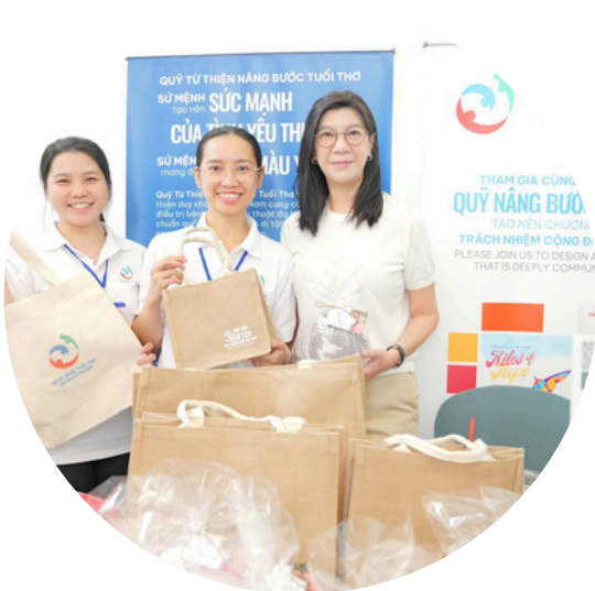
Consular Club International Charity Bazaar 2025