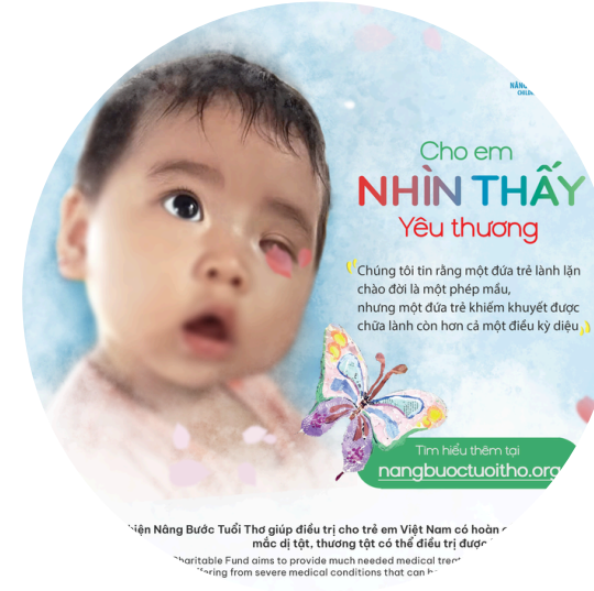
“Lighting Up Our World With Love” A Campaign for Children with ROP and Retinoblastoma