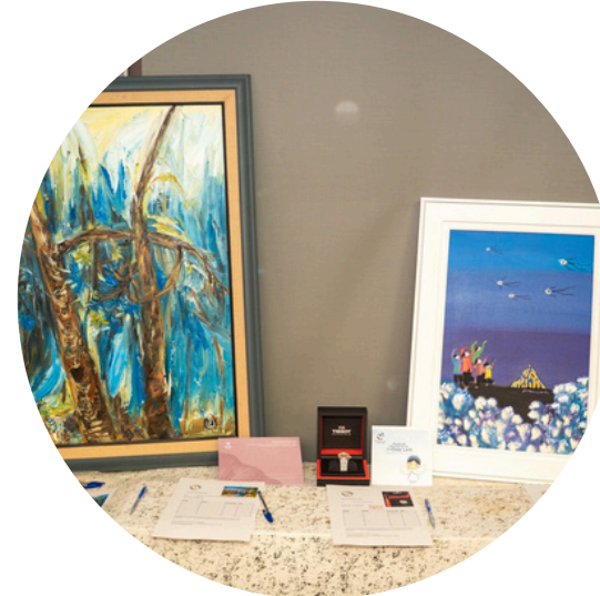
Evening of Appreciation Consular Club of HCMC