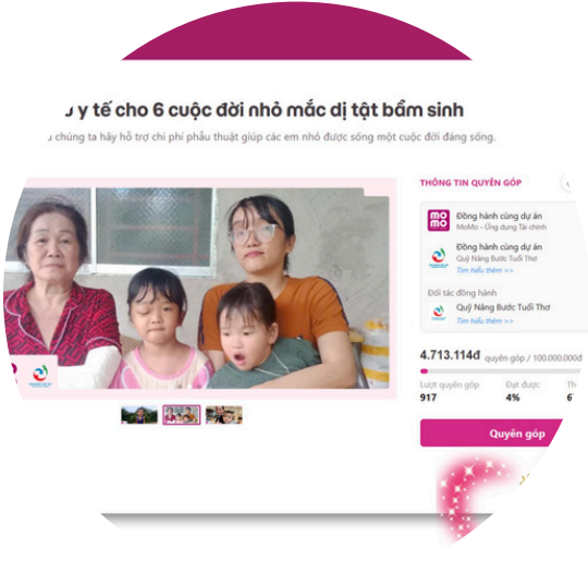
Medical Miracles for Six Young Lives on the MoMo Piggy Bank Community