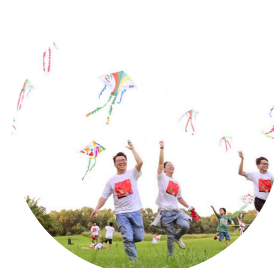
Kite of Hope 2024 Offline Mini Event