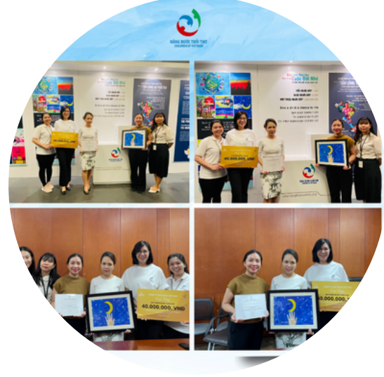
Let's Walk for Love Glints Vietnam