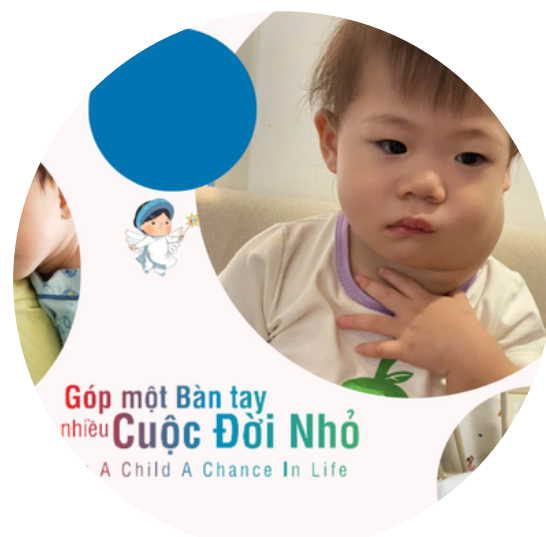
Deploy campaigns on online platforms such as Give.Now, MoMo, Give.Asia, and App ThienNguyen