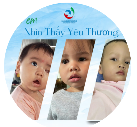
"Lighting Up Our World With Love" A Campaign for Children with ROP and Retinoblastoma

We would like to express our gratitude to all, for your kind heart and contribution. Your silent support has been and will be your long-lasting and reliable support for us. We all know, good deeds always bring good results and we will bring happiness to the children's future.