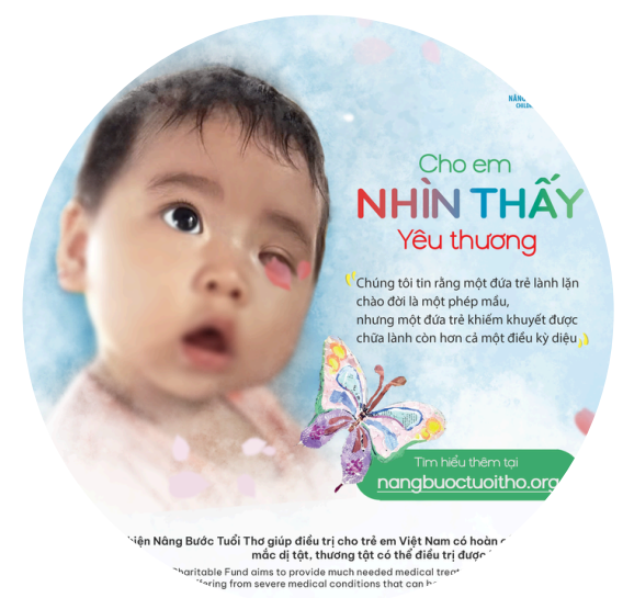
“Lighting Up Our World With Love” A Campaign for Children with ROP and Retinoblastoma

We would like to express our gratitude to all, for your kind heart and contribution. Your silent support has been and will be your long-lasting and reliable support for us. We all know, good deeds always bring good results and we will bring happiness to the children’s future.