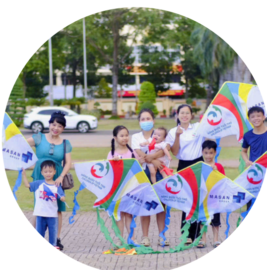
The Kite of Hope at Buon Ma Thuot Square