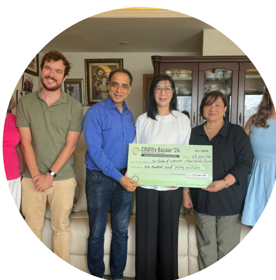
The campaign “Lighting Up Our World With Love” in collaboration with the Consular Club HCMC