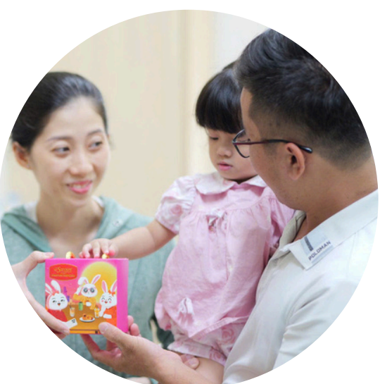
Savouré The Mid-autumn Festival Gives The Miracle of Love 2025