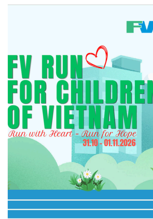
FV RUN for Children of Vietnam 31.10 - 01.11.2026