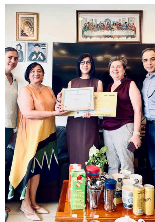
"Lighting Up Our World With Love" 2025 Campaign with Consular Club of Ho Chi Minh City