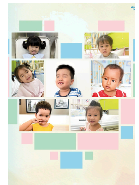
"Lighting Up Our World With Love" A Campaign for Children with ROP and Retinoblastoma

We would like to express our gratitude to all, for your kind heart and contribution. Your silent support has been and will be your long-lasting and reliable support for us. We all know, good deeds always bring good results and we will bring happiness to the children's future.