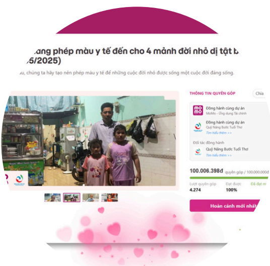
Fundraising to Support 4 Children with Congenital Disabilities Together with the Kind-Hearted MoMo Piggy Bank Community on the MoMo Super App