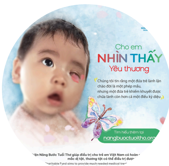
“Lighting Up Our World With Love” A Campaign for Children with ROP and Retinoblastoma

We would like to express our gratitude to all, for your kind heart and contribution. Your silent support has been and will be your long-lasting and reliable support for us. We all know, good deeds always bring good results and we will bring happiness to the children’s future.