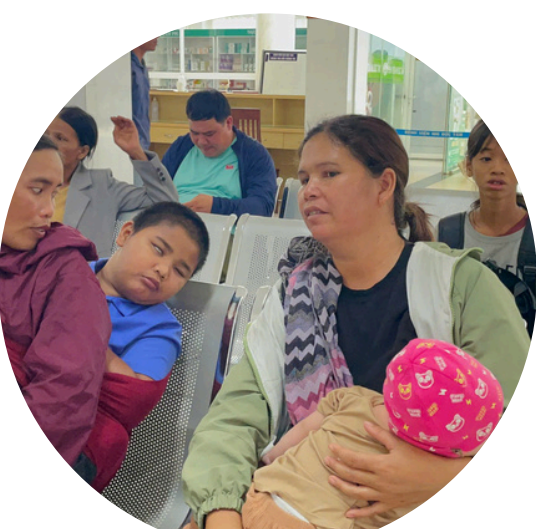
Free Medical Screening for Disadvantaged Children in Dak Lak June 2024