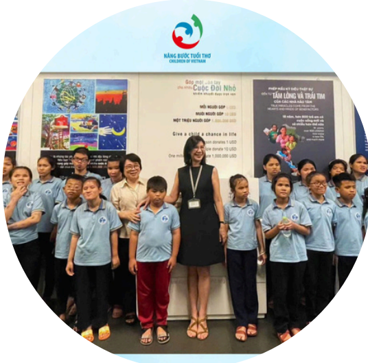
HP Bacteria Screening for Visually Impaired & Multi- Disabled Children at Huynh Đệ Như Nghĩa Shelter