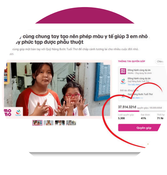
Fundraising to Help 3 Children Have Healthy Hands In collaboration with the compassionate Heo Dat MoMo community on the MoMo Super App