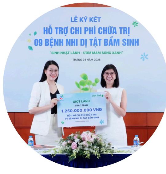
Giọt Lành Partners with CVCF Bringing Medical Miracles to 9 Children with Disabilities.