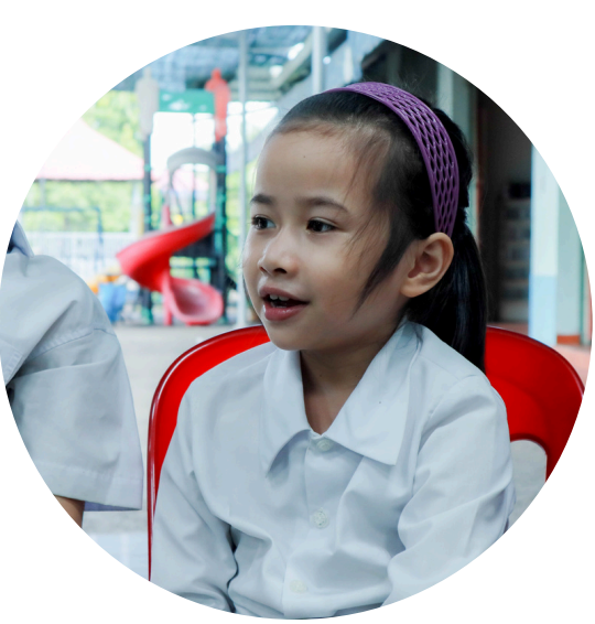
HP Bacteria Screening for Visually Impaired & Multi-Disabled Children at Huynh Đề Như Nghĩa Shelter