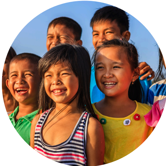
Implementing a treatment campaign for underprivileged children with congenital disabilities and accident-related injuries in areas affected by Typhoon Yagi