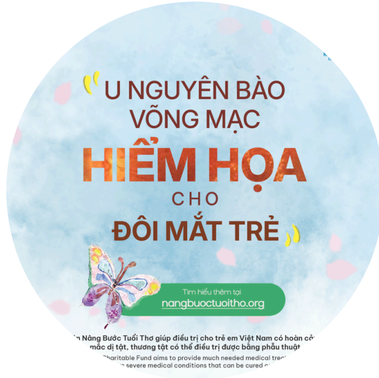
“Lighting Up Our World With Love” A Campaign for Children with ROP and Retinoblastoma

We would like to express our gratitude to all, for your kind heart and contribution. Your silent support has been and will be your long-lasting and reliable support for us. We all know, good deeds always bring good results and we will bring happiness to the children’s future.