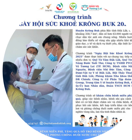
Free Medical Screening Program for Underprivileged Communities in Krông Buk District – 2025