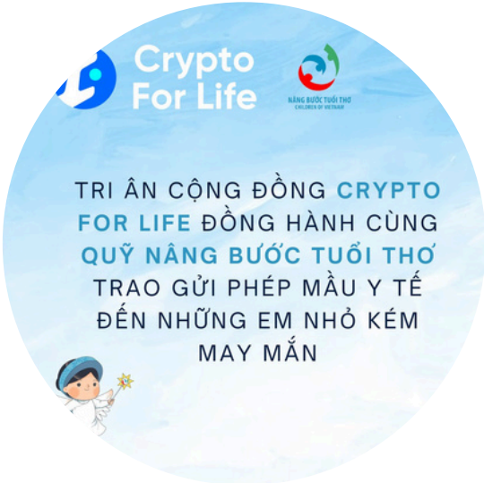
Crypto For Life x The Children of Vietnam Charitable Fund Sending medical miracles to fragile young lives