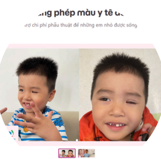
Medical Miracles for Four Young Lives on the MoMo Piggy Bank Community