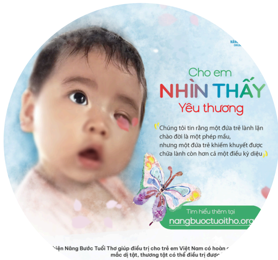
“Lighting Up Our World With Love” Campaign 2026, in collaboration with the Consular Club HCMC