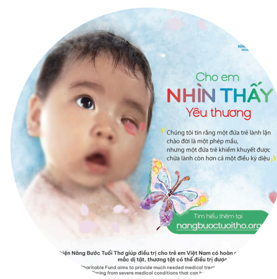
"Lighting Up Our World With Love" Campaign 2026, in collaboration with the Consular Club HCMC