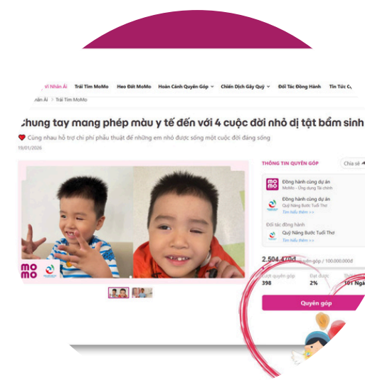
Fundraising campaigns on online platforms: Give.Now, MoMo, Give.Asia, and the ThienNguyen App