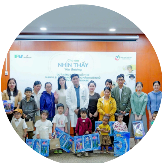
Meeting with retinoblastoma patients