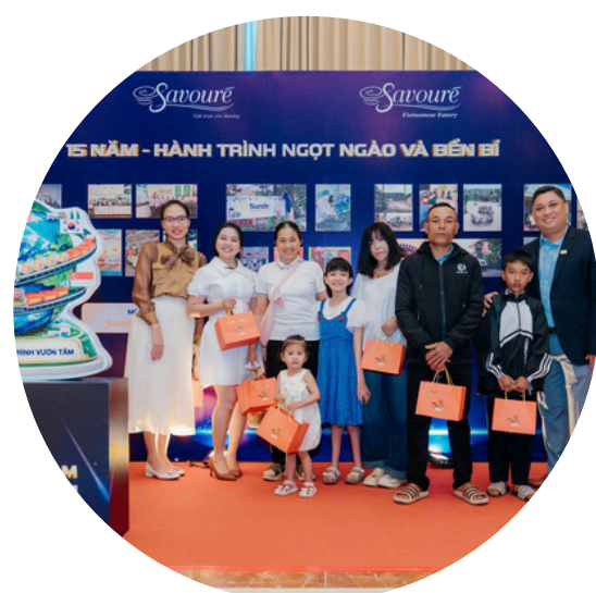
Attended Savouré Bakery's 15th Anniversary Event