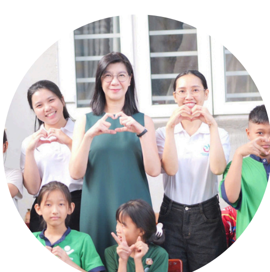
Medical screening program at Vinh Son Charity Class (Bien Hoa, Dong Nai Province)