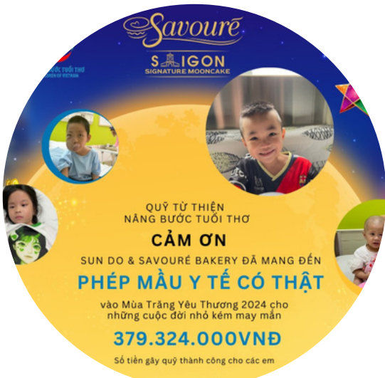
Mid-Autumn Festival 2024 A total of 379,324,000 VND has been donated by Sun Do & Savouré Bakery to The Children of Vietnam Charitable Fund.