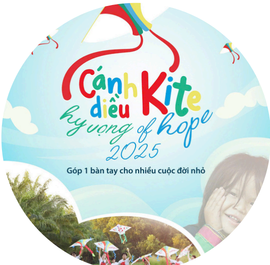
Mini Event Kite of Hope 2025