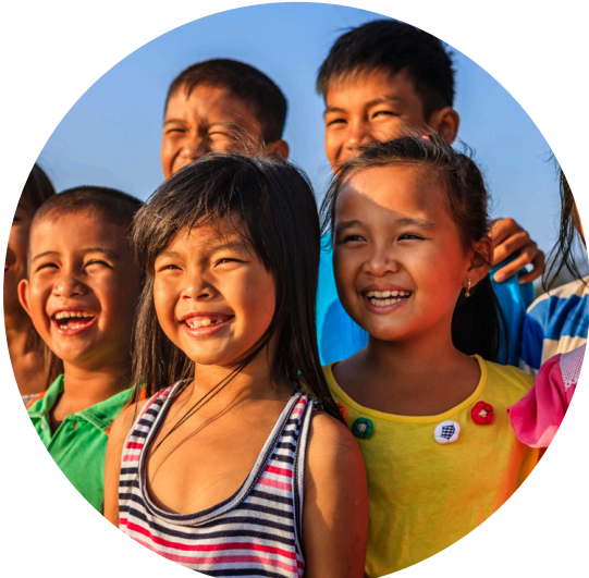
Implementing a treatment campaign for underprivileged children with congenital disabilities and accident-related injuries in areas affected by Typhoon Yagi