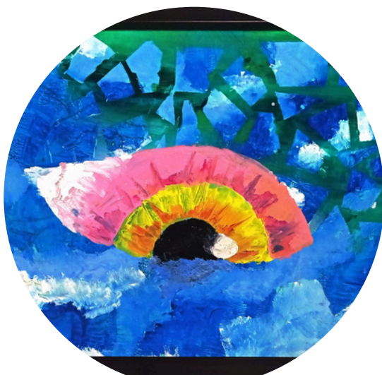
“Lighting Up Our World With Love” A Campaign for Children with ROP and Retinoblastoma

We would like to express our gratitude to all, for your kind heart and contribution. Your silent support has been and will be your long-lasting and reliable support for us. We all know, good deeds always bring good results and we will bring happiness to the children’s future.